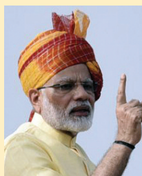
Prime Minister Narendra Modi, in his Independence Day speech on August 15, 2017

January 1, 2018 will not be an ordinary day – those born in this century will start turning 18. For these people, this is a decisive year of their lives. They are going to be the creator of the destiny (Bhagya Vidhata) of our nation in the 21st century. I heartily welcome all these outh, honour them and offer my respects to them. You have an opportunity to shape the destiny of our country. A proud nation invites you to become a part of its developmental journey.